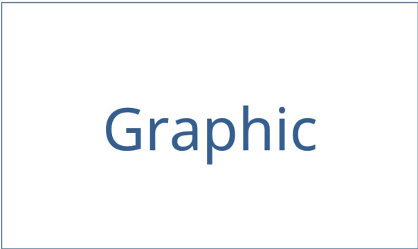
Figure 1 Figure caption.